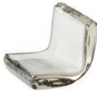
7/8" x 1 3/8" Cove (22 x 35mm)