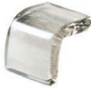
7/8" x 1 3/8" V-Cap (22 x 35mm)