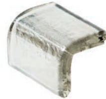
1 3/8" x 1 3/8" V-Cap (35 x 35mm)