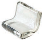
7/8" x 7/8" Cove (22 x 22mm)