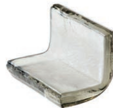
1 3/8" x 1 3/8" Cove (35 x 35mm)

Trim not available in Textura *All Sizes are Nominal