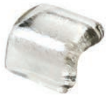
7/8" x 7/8" Quarter Round (22 x 22mm)

Trim is available in the mosaic color palette. Shown in Platinum Irid.